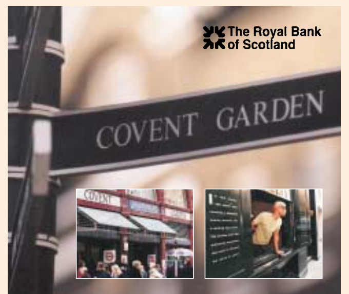
The ING Covent Garden Limited Partnership created.