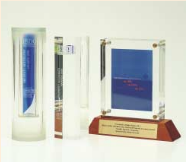
Three time winner of the BDO Stoy Hayward Smaller Companies Property Accounts Award.