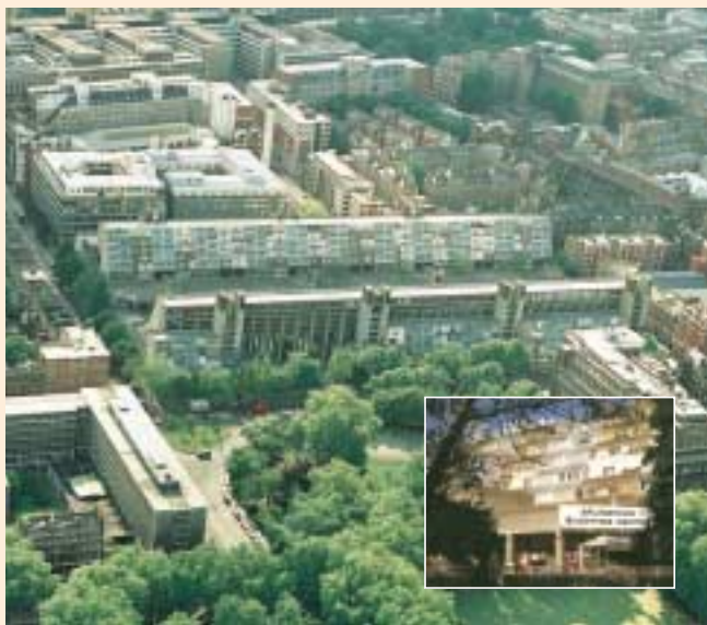
The Brunswick Shopping Centre, Bloomsbury, London W1.