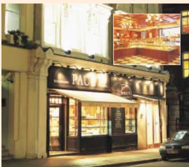
Inigo House, Covent Garden - Investment acquired, refurbished/extended, pre-let and sold.