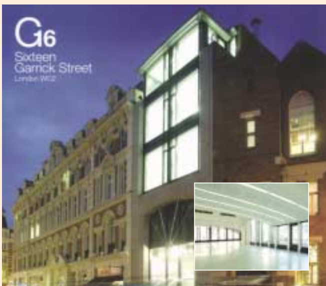
Central London mixed use scheme - institutional development management.