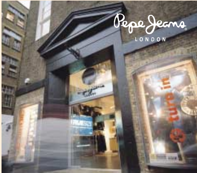
Seven Dials, Covent Garden, London W1.