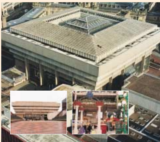
Paradise Forum Shopping Centre, Birmingham - an investment and strategic development opportunity.