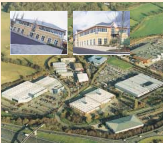
Turnhams Green, Junction 12, M4 developed, let and funded.