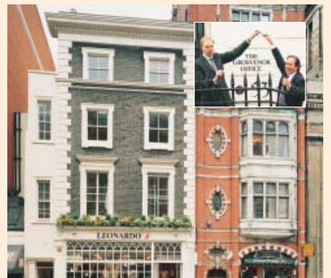
The Grosvenor Estate Portfolio purchase - Mayfair and Belgravia.