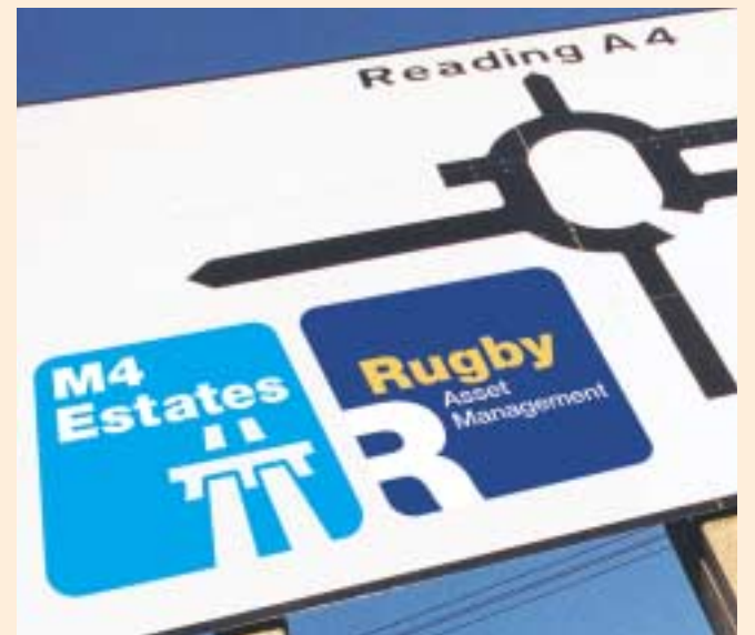
M4 Estates launched. Growth in asset management.